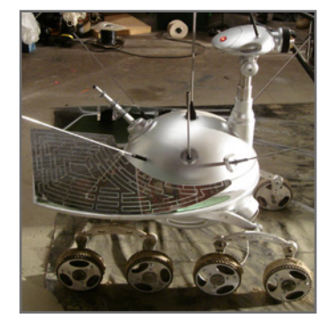
Special effects designers at Artem built this moon buggy prop for a BBC advertisement using parts created with a Dimension 3D Printer.