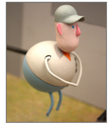
Model makers painted the charming finishing touches on the farmer and his family.