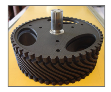
A wheel from Artem BBC moon buggy the Dimension 3D Printer can be used to produce functional moving parts, as well as prototypes and models.

Stratasys | www.stratasys.com | info@stratasys.com