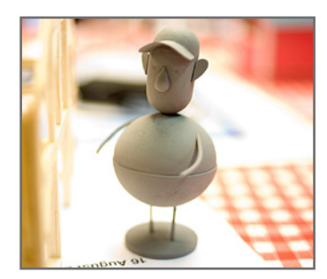
This farmer's face was part of a tray of models printed overnight.

"The beauty of using the Dimension 3D Printer for this project was that we could produce exact replicas of the animatic drawings, rather than guessing about sizes and details as we might have done with hand-sculpted models," Thorne said. "To be honest, before we got the Dimension 3D Printer, we would have subcontracted out this type of work, but now that we have the right tool for the job, we are saving both time and money."