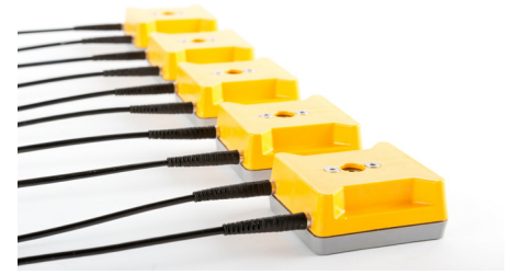
3D printed fiber-optic sensor housings for Fugro

Promolding's 3D printing progression continues with the company's latest innovation, Printed Injection Molding (PRIM) operations. “PRIM will be available to our customers as an additional service in parallel to prototyping and traditional injection molding,” said Gross. “Our state-of-the-art 3D printer has enabled us to achieve this and given us an incredible level of flexibility. We can use the technology to speed up the design process and develop, review and adapt prototypes earlier, but also extend the efficiencies into production through our PRIM process. It really has been a game-changer thanks to 3D printing and we've seen the benefits passed onto our customers.”